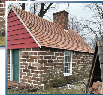
BELOW, THE OPPOSITE SIDE AS COMPLETED.