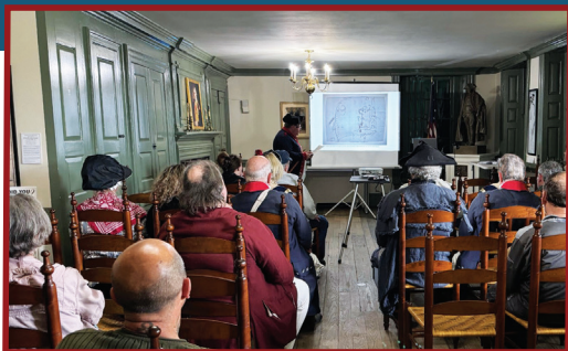
PRESENTATIONS WERE IN THE STEUBEN HOUSE

In 1962, when a small group of guys formed a shooting club dressed in 18th century period clothing and firing flintlock muskets at the Cantonment in New Windsor, NY, the Brigade of the American Revolution was born. Researching the clothing and other accoutrements that were used during the period, they focused on portraying the years 1775 through 1783, the Revolutionary War. To do research was a lot more time intensive than with little material available. Over time, more information became more accessible and the interpretation improved. Shooting demonstrations and reenactments were held as other members joined in and more units were formed. Today, The BAR has over 100 units with approximately 1,000 members. Continental soldiers, Colonial Militias, British Regulars, Loyalists, Native Americans, French Regulars, Hessians, Jagers and Camp Followers, along with a supportive Civilian contingent are some of the units that make up the BAR. These are the reenactors that participate in the historic events at HNBL and as well, throughout the eastern US.