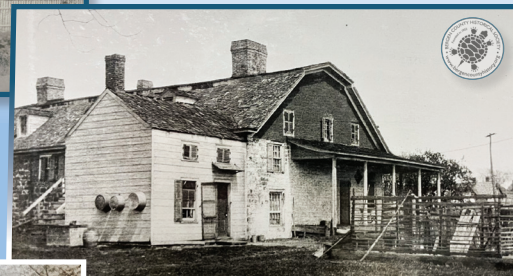
PIC 4 THIS PHOTOGRAPH SHOWS ANOTHER VIEW OF THE WRAP-AROUND PORCH AND KITCHEN ON THE BACK. NOTE A THIRD SHORT CHIMNEY AND TWO DORMERS ON THE BACK ROOF--ONE IS HIDDEN.