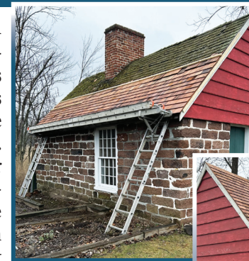
LEFT, AS THE OLD ROOF IS REMOVED, BRIGHT NEW CEDAR SHINGLES ARE INSTALLED.

Maintenance is essential at HNBL for offering the best experience possible for visitors as well as staff. Natural elements of weather and moss will take their toll on a 34 year old roof. This spring the original cedar roof on the Out Kitchen was replaced through funding by the HNBL Park Commission. Fresh copper flashing was applied at the chimney. A chimney cap is planned for keeping rain and snow from coming down and damaging the hearth and fireback. The windows were re-glazed and painted last year. The doors and the two gable ends are in the plans to be painted this season.