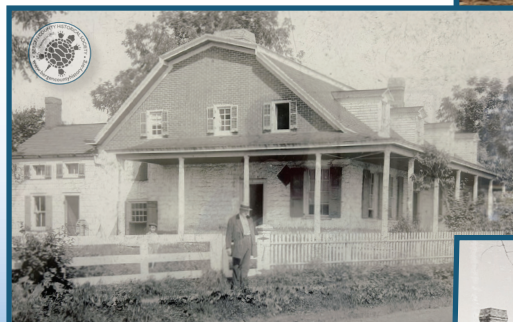
PIC 2 ONE OF THE EARLIEST KNOWN PHOTOGRAPHS OF THE HOUSE, SHOWING THE ATTACHED TRADING POST THAT WAS REMOVED BEFORE 1890. NOTE THE WHITEWASHED LOWER STORY AND THERE ARE THREE DORMERS.