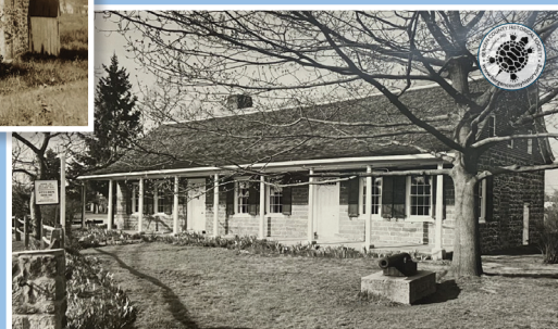
PIC 6 THIS PHOTOGRAPH IS DATED 1954, SHOWS THE HOUSE WITHOUT DORMERS, AND PORCH SCREENS REMOVED. NOTE THE HISTORIC SIGN AT THE FAR LEFT. THE CANNON AT THE BOTTOM RIGHT WAS LATER STOLEN, AND STILL IS MISSING.