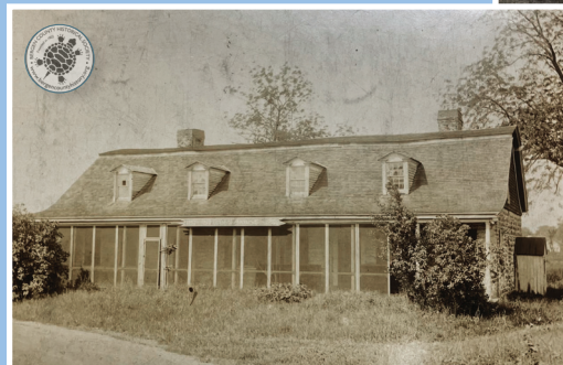
PIC 5 THE ATTACHED KITCHEN, WRAP-AROUND PORCH, AND CENTER CHIMNEY HAVE BEEN REMOVED. THE FRONT PORCH IS SCREENED IN AND WHITEWASH IS REMOVED. A SMALL SHED PROTECTS A DOOR TO THE NORTH SIDE INTERIOR KITCHEN. C. 1938.