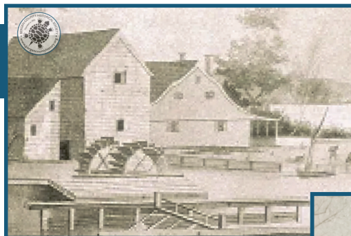
A visual timeline of the mansion's exterior