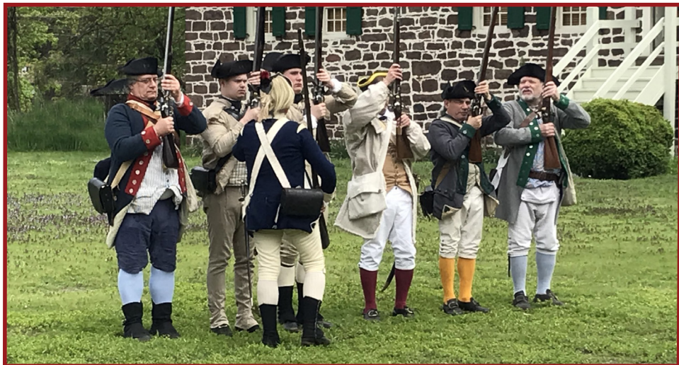
DRILL PROCEDURES BEHIND THE STEUBEN HOUSE