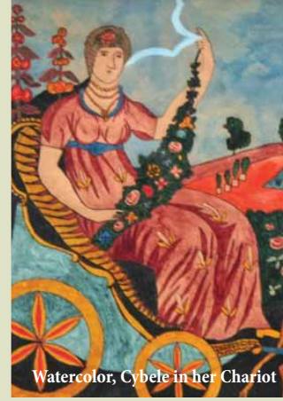
Watercolor, Cybele in her Chariot