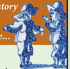
18th century tile BCBS collections