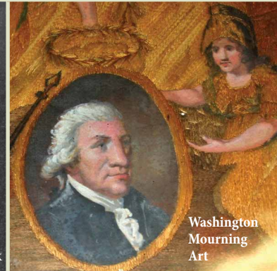
Washington Mourning Art