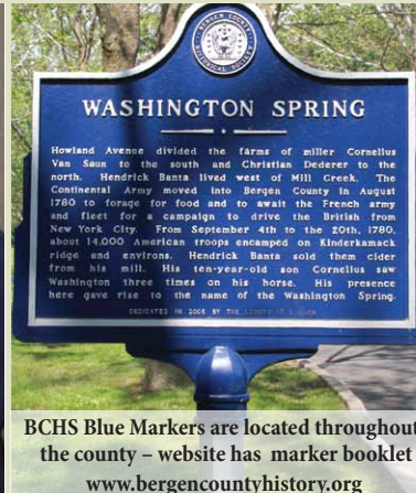
BCBS Blue Markers are located throughout the county – website has marker booklet www.bergencountyhistory.org