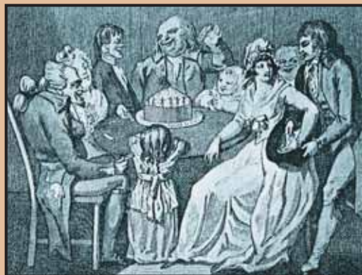
Twelfth Night, 1794