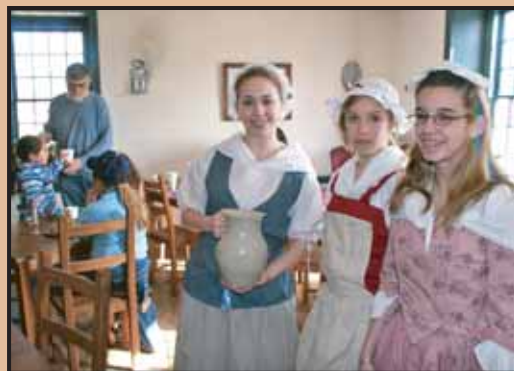
Special thanks to all our interpreters