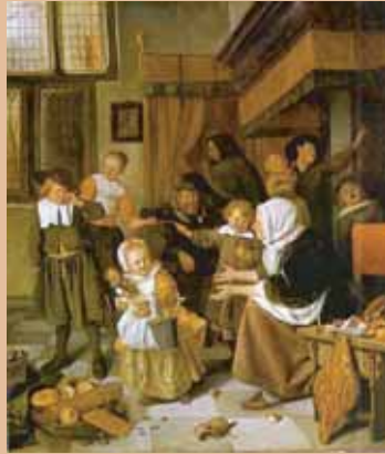
Jan Steen's The Visit of St. Nicholas , 1664 can be seen at the Steuben House