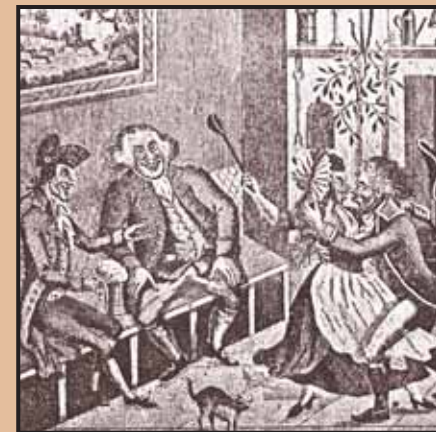
Kissing Under the Mistletoe, 1794

Mulled Cider, Coffee, Tea O'Doul's Kerry's Ale & Patriot's Lager (Non-alcoholic)