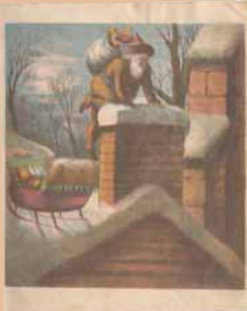
An original copy of The Night Before Christmas , by Thomas Nast, 1869 can be seen at the Steuben House